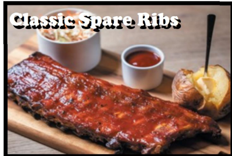
Classic Spare Ribs