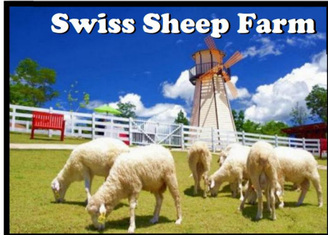
Swiss Sheep Farm