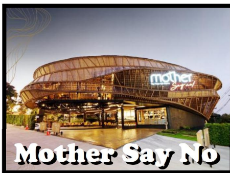
Mother Say No