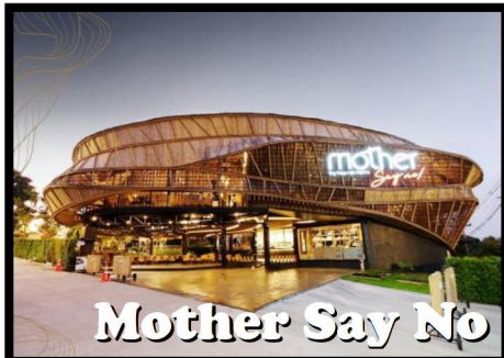
Mother Say No