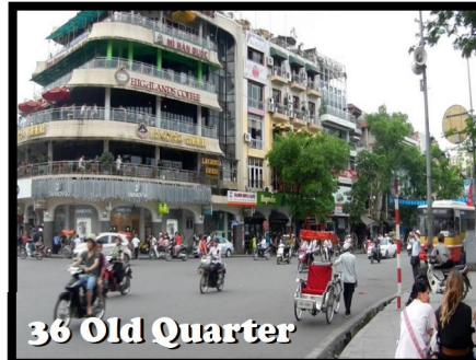
36 Old Quarter