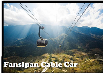
Fansipan Cable Car