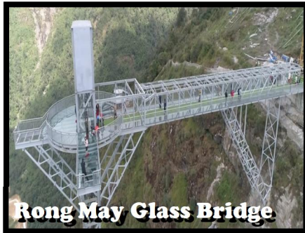
Rong May Glass Bridge