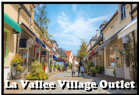
La Vallee Village Outlet