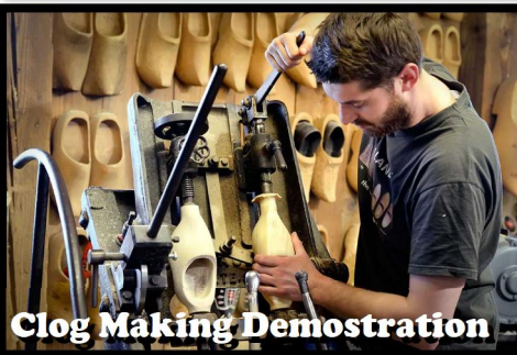
Clog Making Demostration

Home Sweet Home with lots of sweet memories!