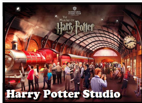
Harry Potter Studio