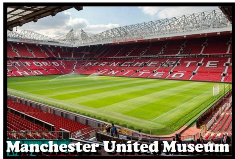
Manchester United Museum