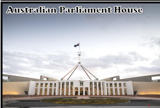
Australian Parliament House

6 Port Stephens – Sydney (BL) Today, enjoy Quad Biking Sand Dune Adventure on the awesome 32km long Stockton bight sand dunes. After that, proceed to visit Irukandji Shark & Ray Encounters . Dinner at own arrangement. **Irukandji Shark & Ray Encounters –Is an interactive aquarium where you have the opportunity to feed and pet a variety of sharks and rays. Being able to access shallow water is a whole new experience for the whole family as you can wade up close to the fish. **Overnight at Sydney