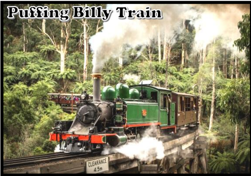
Puffing Billy Train