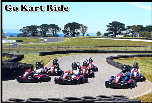
Go Kart Ride