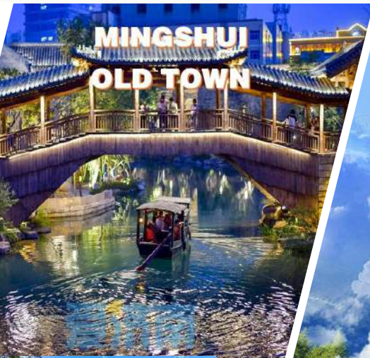
MINGSHUI OLD TOWN