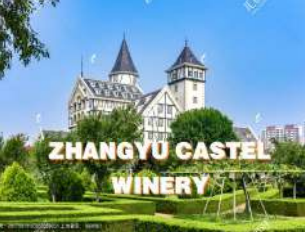
ZHANGYU CASTEL WINERY