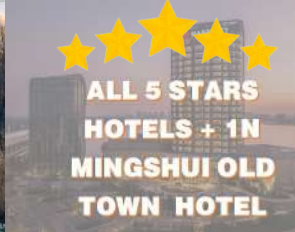
ALL 5 STARS HOTELS + 1N MINGSHUI OLD TOWN HOTEL