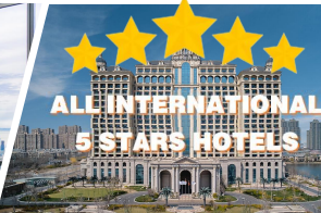
ALL INTERNATIONAL 5 STARS HOTELS

➢ Gather at Penang International Airport for your flight to Qingdao.