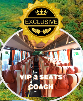
VIP 3 SEATS COACH