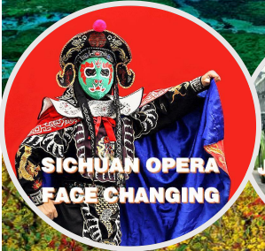
SICHUAN OPERA FACE CHANGING