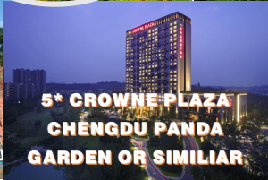
5* CROWNE PLAZA CHENGDU PANDA GARDEN OR SIMILIAR