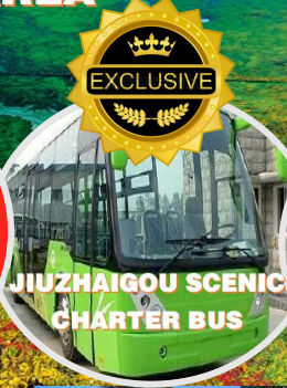
JIUZHAIGOU SCENIC CHARTER BUS