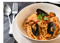
Adriatic Seafood Pasta