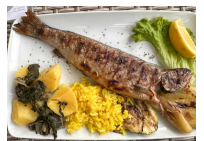
Grilled Fresh Trout Fish